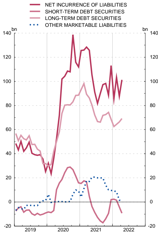
STATE. NET INCURRENCE OF LIABILITIES. BY INSTRUMENT Lastest 12 months