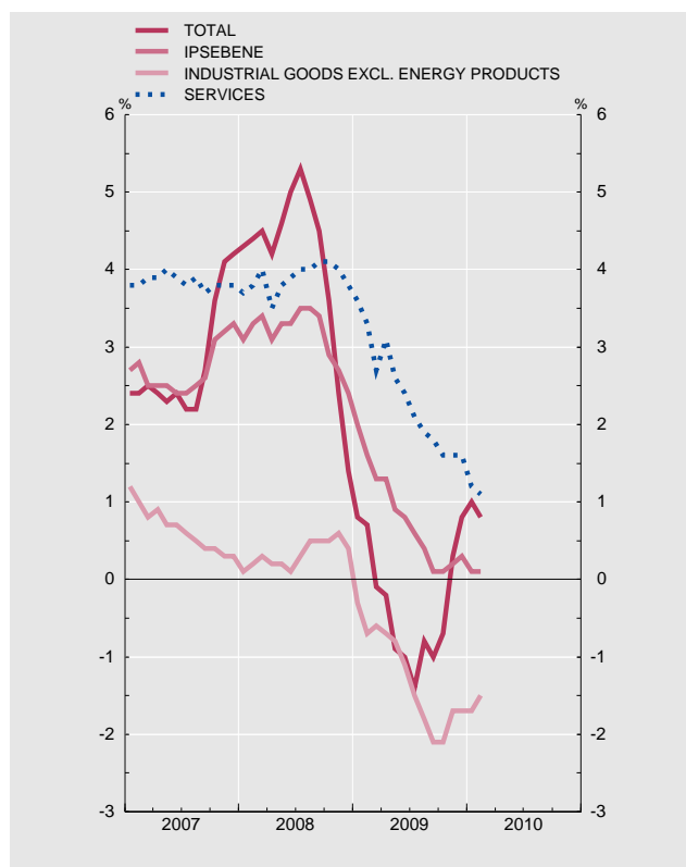
CONSUMER PRICE INDEX. TOTAL AND COMPONENTS Annual percentage changes