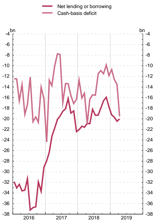
STATE. NET LENDING OR BORROWING AND CASH-BASIS DEFICIT Lastest 12 months