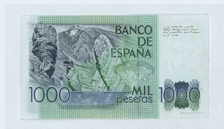
The 1,000 peseta banknote from 1979 features the head of Benito Pérez Galdós, based on a portrait by Sorolla, on the obverse side (left) and a landscape of the Canary Islands, the writer’s homeland, on the reverse side.