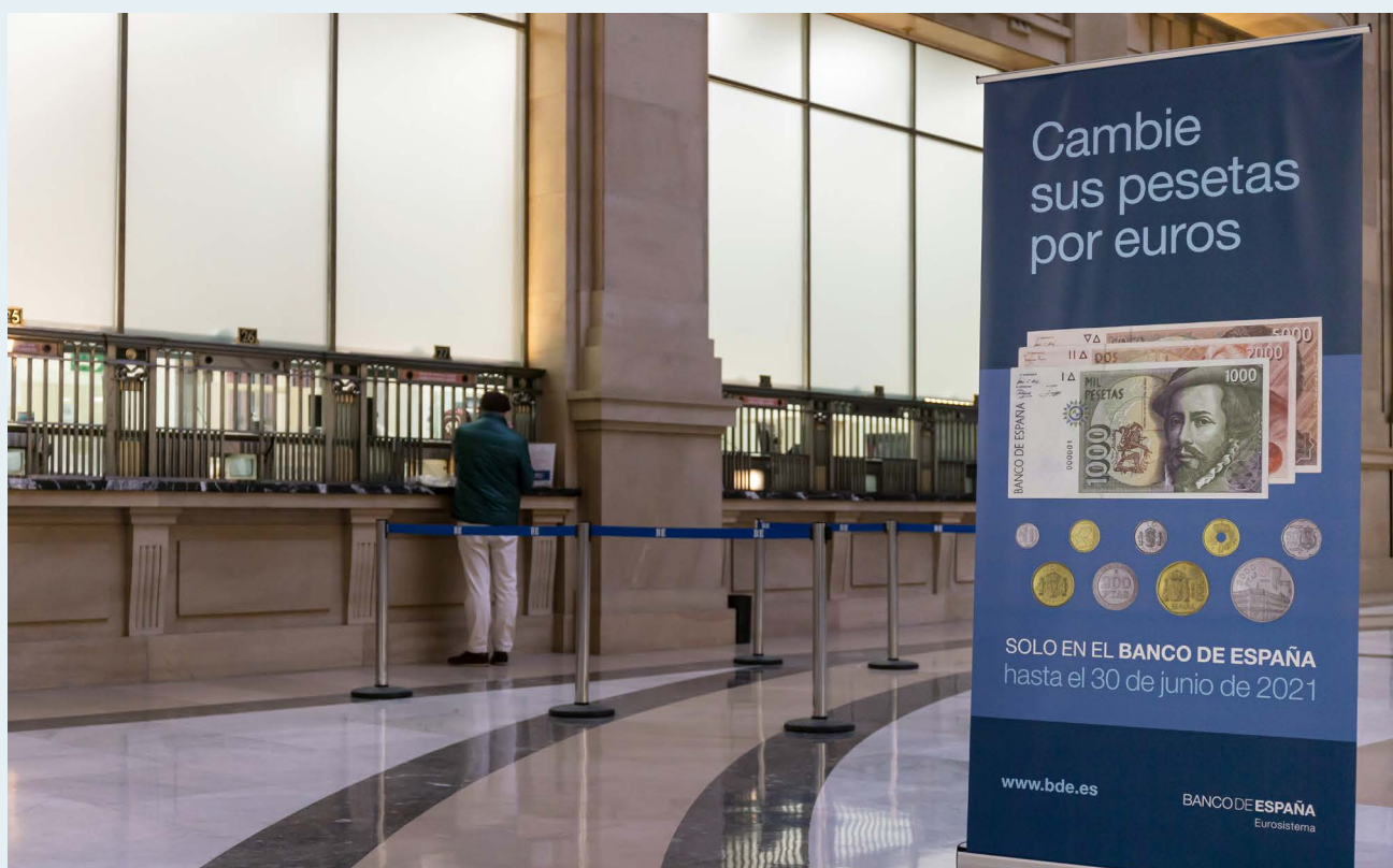
The exchange of pesetas for euro can be made both at the Banco de España central headquarters in Madrid (C/ Alcalá 48) and at its branches.