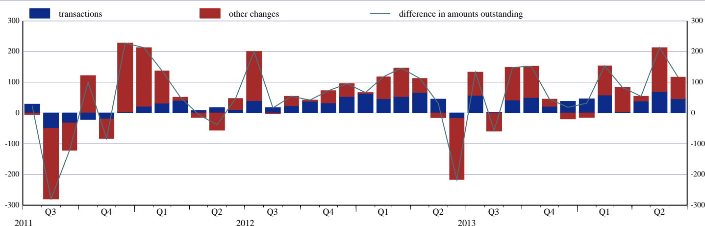
Chart 2 Transactions in shares/units issued by investment policy of euro area investment funds other than money market funds

(EUR billions; not seasonally adjusted; outstanding amounts at the end of the period; transactions during the period; monthly data)