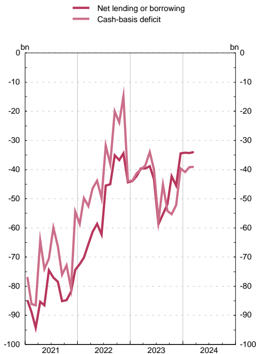
STATE. NET LENDING OR BORROWING AND CASH-BASIS DEFICIT Lastest 12 months