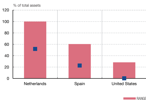
1 TOTAL FOREIGN LENDING