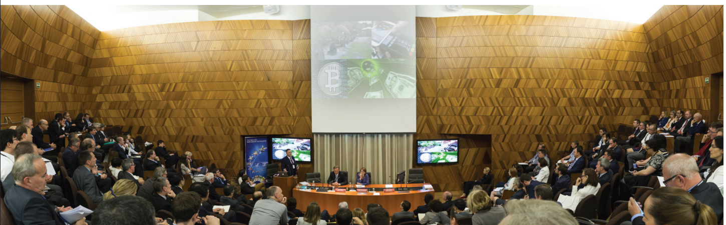
Seminar on the €50 banknote (second series), organised for professional cash handlers by the Banco de España and the European Central Bank.

Lastly, it should be noted that in 2016 the Banco de España was, for the first time, supplied with banknotes exclusively produced by IMBISA, a specific resource of the Bank which was created at the end of 2015.