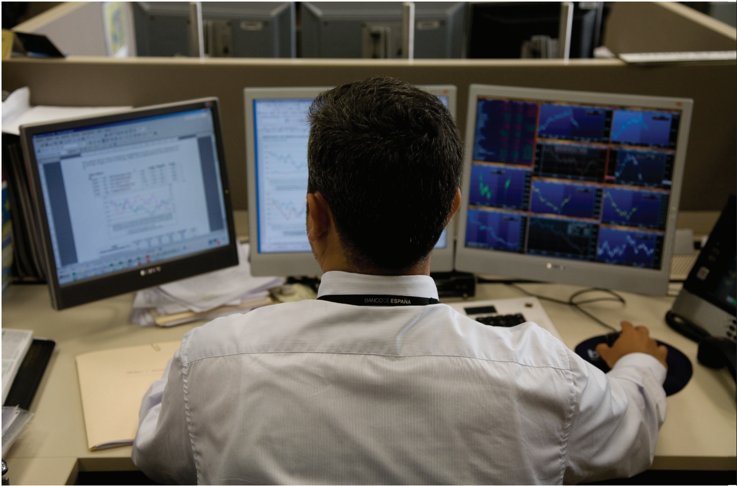
Operations Room at Banco de España.