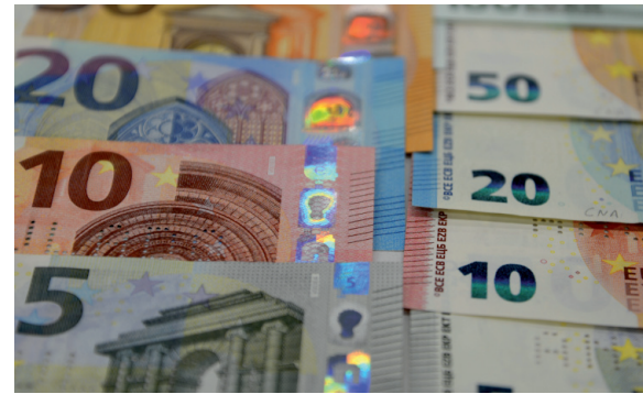
Europa series euro banknotes.

promote the adaptation of banknote-accepting machines, so that they are able to process the new banknotes from the moment they start circulating.