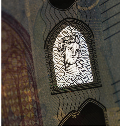
A portrait window of princess Europa in the hologram of the €20 banknote (second series).