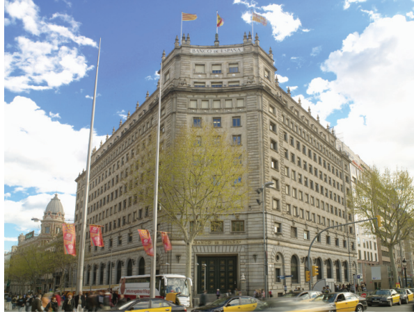
Façade of the Barcelona branch office.

The web portal offering services to institutions and organisations (RedBdE) has been modernised.