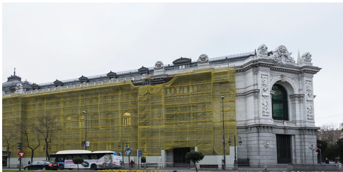
Comprehensive restoration and cleaning of the façade of the Banco de España's headquarters.

In the area of IT systems, a number of activities and projects were carried in 2016 to provide support for the functions of the Banco de España. These notably include: