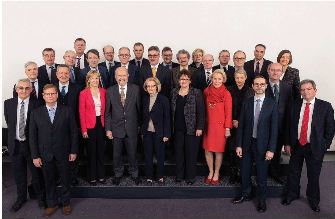
The Supervisory Board of the European Central Bank, which supervises 14 Spanish banking groups.

At the end of 2016, the Banco de España adopted the capital decisions corresponding to less significant institutions. The supervisory review and evaluation process applied by the Banco de España to these institutions was similar to that applied to significant credit institutions.