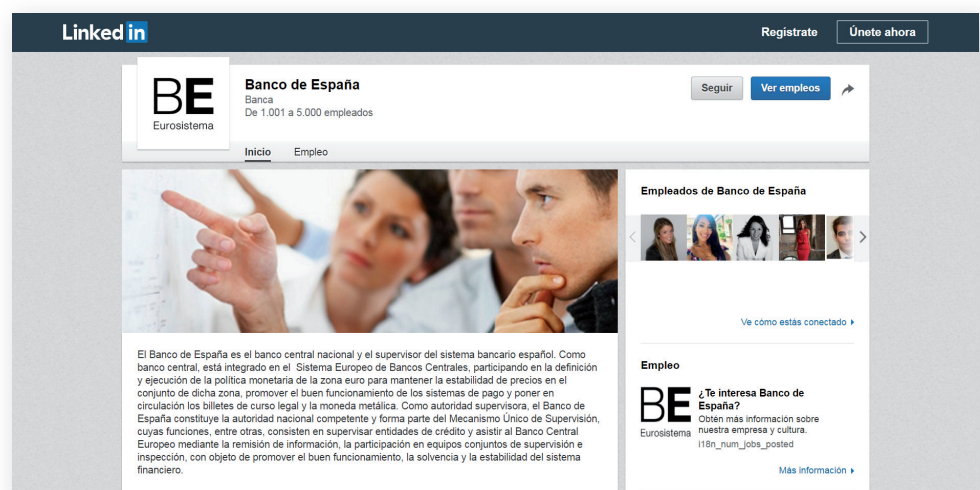
The Banco de España page on the LinkedIn portal.

The plan has other priority goals such as flexible working, teleworking, or internal communications, through new channels which are more effective and closer to employees. To facilitate the transformation, a project was launched to develop a new IT platform for human resource management.